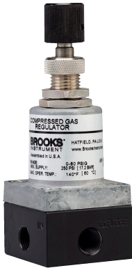
Model 8601 Pressure Regulator