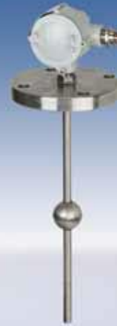
MR783 Multi-Point Level Switch

Point level switches are designed to detect level variations and activate alarms based on one or multiple level points. They can be used for normal, corrosive or hazardous liquids and are certified explosion proof or intrinsically safe. The ANV point level switches are certified and used in highly demanding nuclear power plant applications. Certified material, NACE and radiography options are available to meet customer specifications.