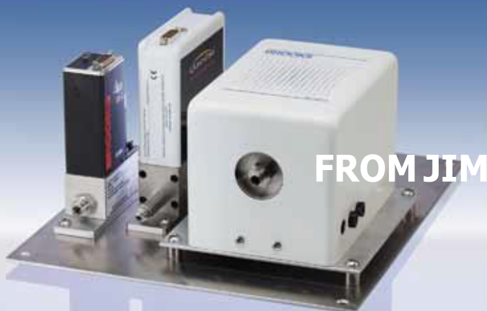
Direct Liquid Injection Vaporizer