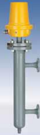
ANV/ANH Point Level Switch