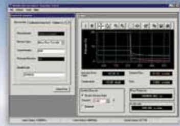
Brooks Service Suite