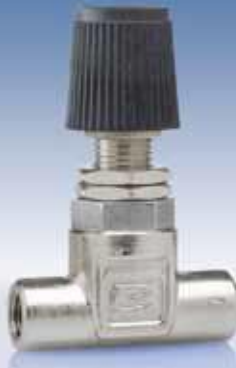
8500 Series NRS™