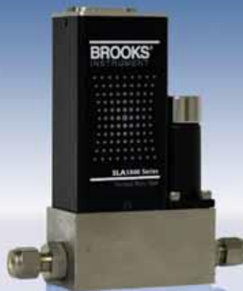
SLA5810/20 Elastomer Series