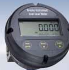
Oval Gear Meter