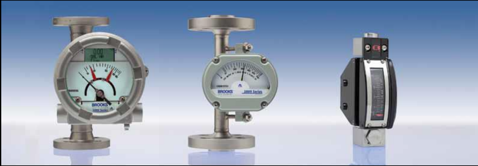
MT3809 XP Flameproof